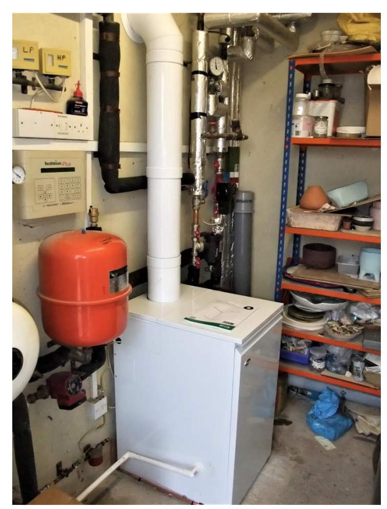
New Boiler at Llanishen Village Hall