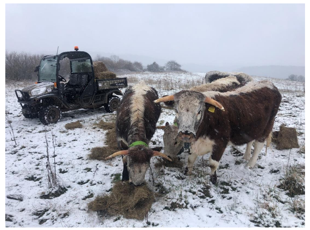
Longhorn cattle and Kubota purchased through Lower Wye Nature Networks project to aid conservation grazing.

This is a Lottery funded partnership project between the AONB Unit, Gwent Wildlife Trust and the Woodland Trust. Delivery continues with a project extension until the end of September 2023. Seven SSSI sites have received valuable investment in habitat management, site infrastructure and equipment. Ten Farms have received advice and mapped opportunities for habitat connectivity; the AONB team are now working with nine landowners to deliver grant aided work on farm. On private farmland 500m of hedgerow have been created and 2,900 trees (provided by Woodland Trust) planted. To date £192,959 of the £279,366 grant has been spent and claimed.