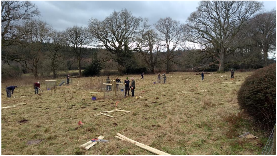
New orchard planting at Ty Mawr reserve