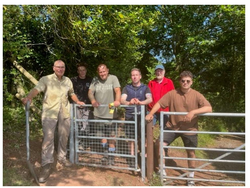
Gate Training with the AONB, Herefordshire Ramblers and British Army at Hoarwithy

The other main project that has come out of the Access for all funding is the development of a new fully accessible loop walk off the Wye Valley Walk- 'The Willow Walk', form Ross-on-Wye to Townsend Farm (RegenBen) at Brampton Abbotts. The Willow Walk will be the only accessible walk that can be used by Tramper/off road buggies used by the 'Wheeler' community in English part of the AONB. The walk will include a picnic site being developed at Townsend farm, which will also be accessible from the Farm via a hard surfaced track enabling those using a standard wheelchair to access the picnic site alongside the river. A leaflet is being designed to accompany the walk which, will include the nature and heritage of the areas that the walk passes though. Other improvements include a new footbridge at Netherton, along a permissive section of path by the river between Ross-on-Wye and Townsend Farm.