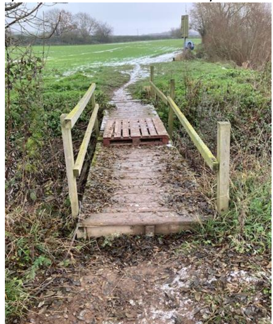
The old Footbridge at Netherton

The other main project that has come out of the Access for all funding is the development of a new fully accessible loop walk off the Wye Valley Walk- 'The Willow Walk', form Ross-on-Wye to Townsend Farm (RegenBen) at Brampton Abbotts. The Willow Walk will be the only accessible walk that can be used by Tramper/off road buggies used by the 'Wheeler' community in English part of the AONB. The walk will include a picnic site being developed at Townsend farm, which will also be accessible from the Farm via a hard surfaced track enabling those using a standard wheelchair to access the picnic site alongside the river. A leaflet is being designed to accompany the walk which, will include the nature and heritage of the areas that the walk passes though. Other improvements include a new footbridge at Netherton, along a permissive section of path by the river between Ross-on-Wye and Townsend Farm.