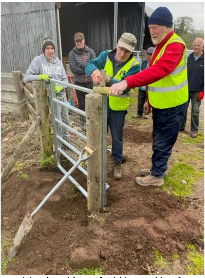
Training day with Herefordshire Ramblers & AONB Volunteers at Walford

In total we purchased 56 gates with Parish Councils requesting gates to improve access in their area. The Heritage loop walk at English Bicknor has also been improved and now barrier free.