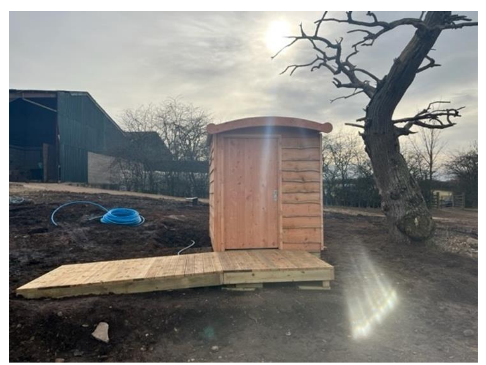
Disabled Compost Toilet at Townsend Farm

The next stage of the project is to replace the very narrow footbridge on the Public Right of Way by Ross-on-Wye Rowing club. A further phase is proposed to extend the Willow Walk beyond Townsend Farm to Foy Bridge (and eventually to Foy Church).