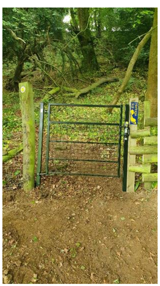
Heritage Loop Walk- English Bicknor