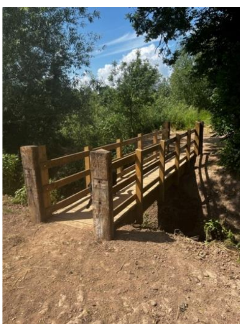
New Footbridge at Netherton